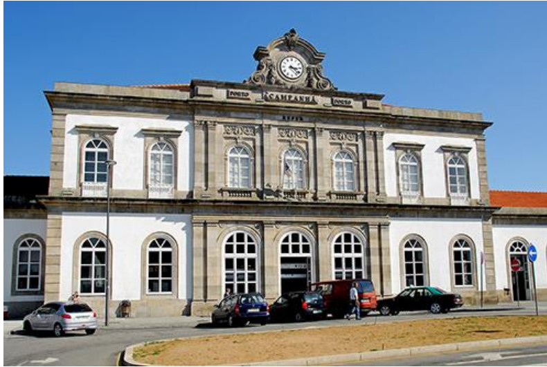
Porto Campanhã Station

Alternatively, you can rent a car at the airport.