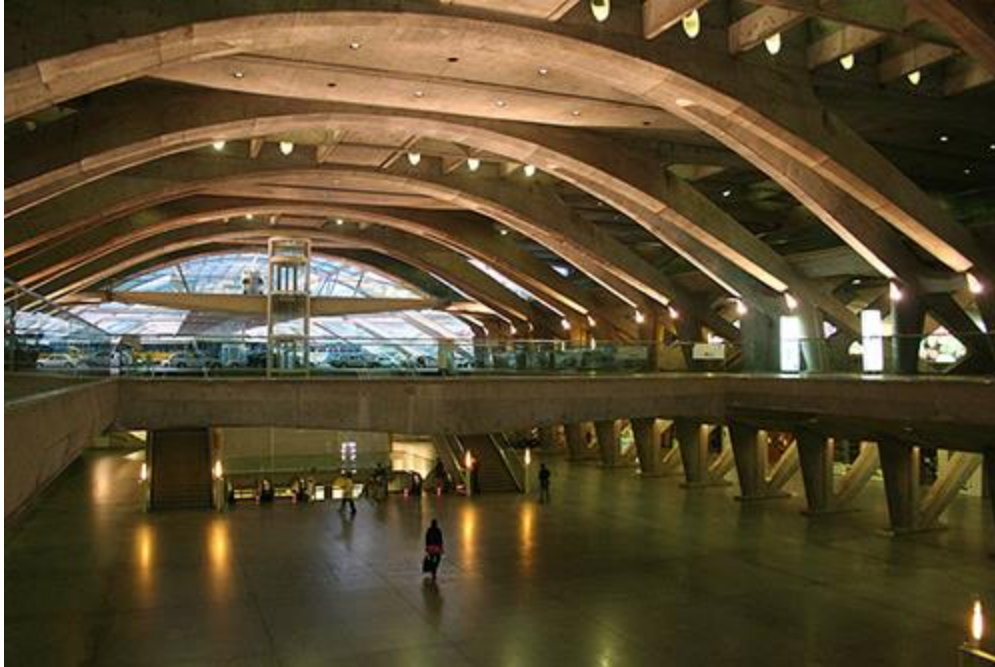
Oriente Station (Lisbon)

Once you get to Oriente Station, you just need to go upstairs to the Train station. You can buy the train ticket in the station during the Ticket office times . Check the Schedule for the times between Lisboa-Oriente and Aveiro. We advise you to take the Intercidades train because the Price is lower. Will take you 2h to 3h15 to reach Aveiro, depending of the train you pick.